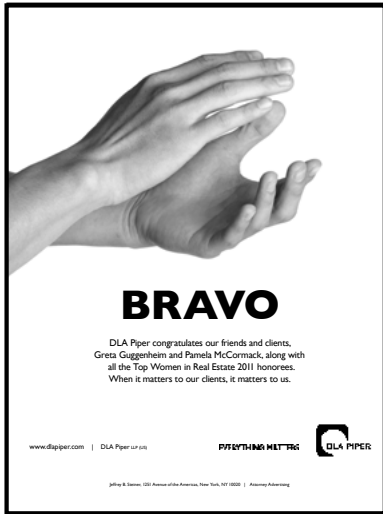
Full Page Bleed Ad